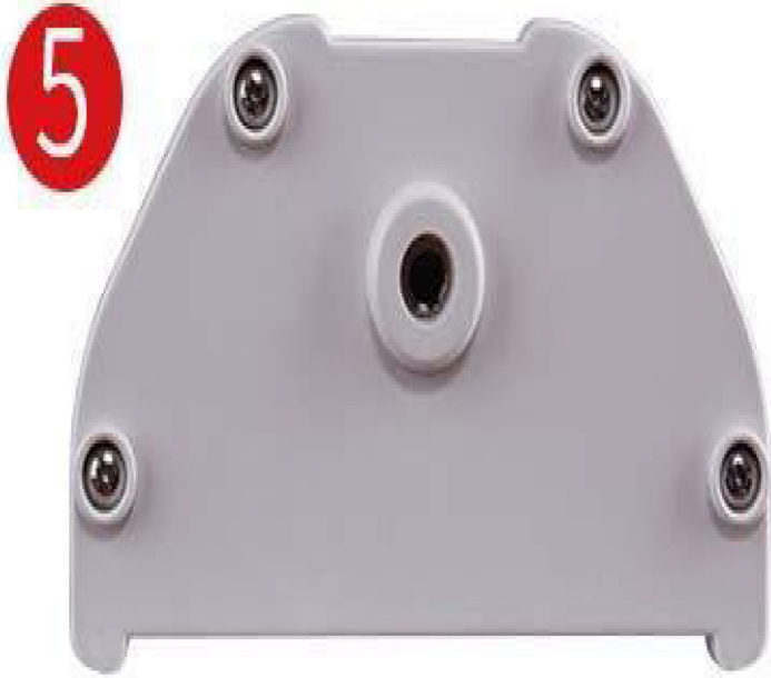
Return to the bottom of the speaker