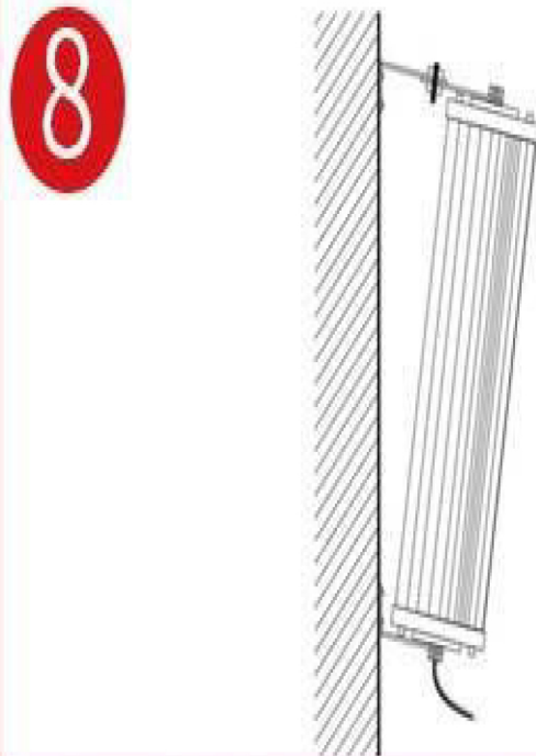
Screw the wall fixing plate to the top of the speaker Fix the speaker in a position that needs to be fixed